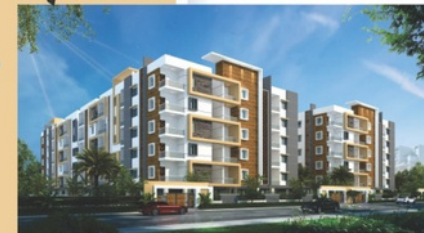
Sri Gayathri RESIDENCY-III